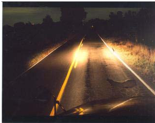
Current production with 7 inch round sealed beam