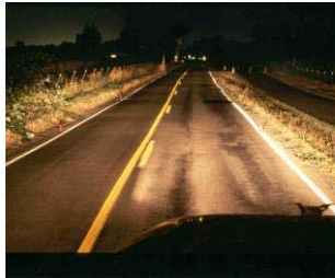
New Century composite headlamp