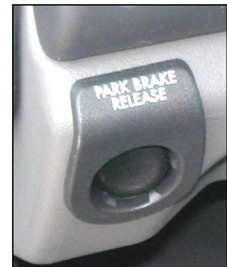
Park Brake Release Button