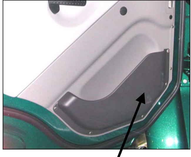
693-003 Plastic manifest box – LH

Freightliner Trucks offers several interior door options on the Business Class M2 to best meet your customer's needs. While the standard door treatment on the M2 is the molded plastic panel, we offer two popular options, the aluminum kick plate and the plastic manifest box.