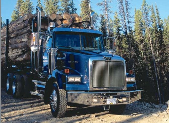
4900 SA 123" BBC Super Visibility Hood

Visit www.westernstartrucks.com for the Western Star Dealer nearest you.