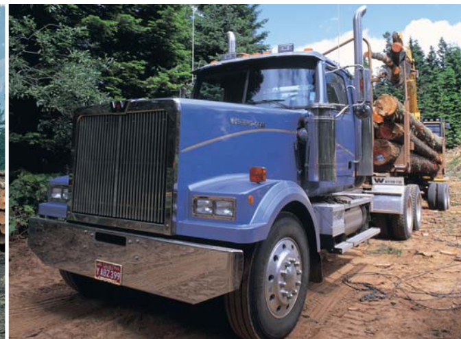
4900 EX 132" BBC