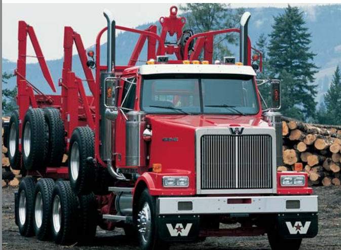
4900 FA 123" BBC