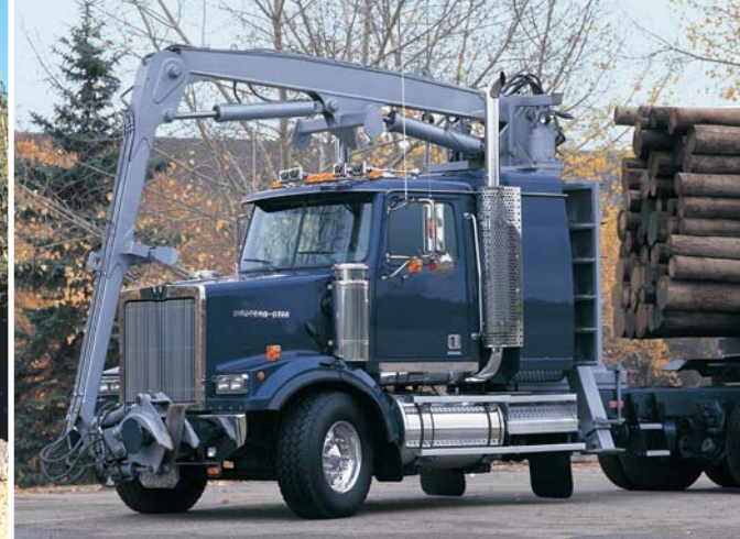
4900 FA 109" BBC