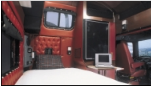
62" High Roof SLS in Mesa trim with "Big Size" Nova Kool fridge