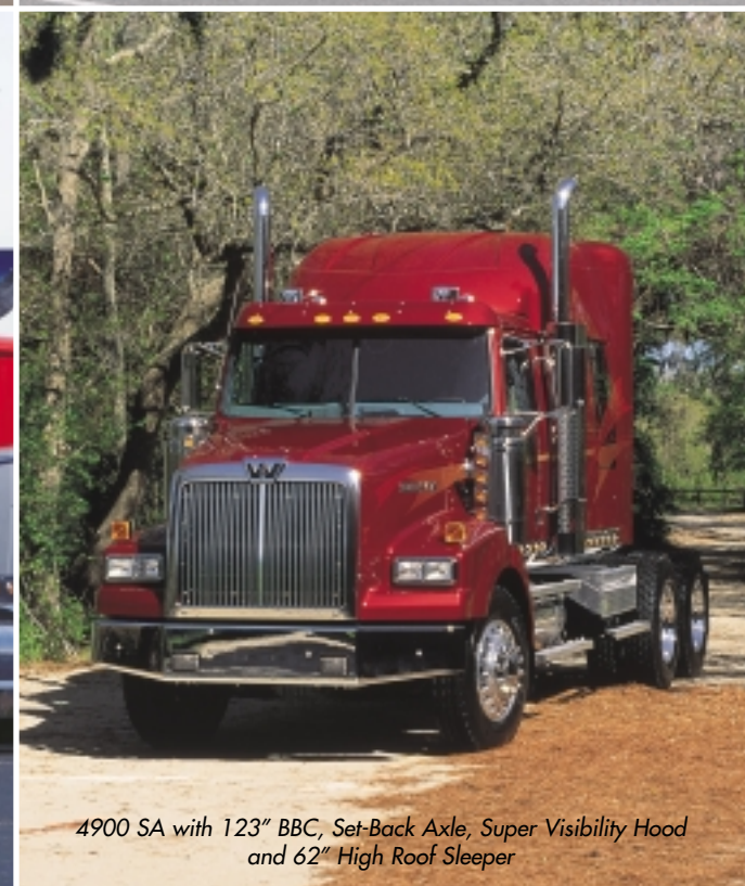
4900 SA with 123" BBC, Set-Back Axle, Super Visibility Hood and 62" High Roof Sleeper