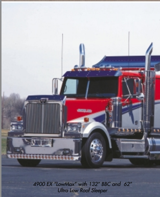
4900 EX "LowMax" with 132" BBC and 62" Ultra Low Roof Sleeper