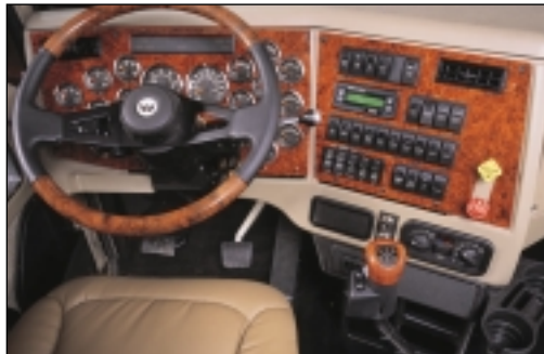
Rocker type switches include LED illuminated symbols for clear identification. Backlit Star Gauges are easy to read, even in bright sunlight.