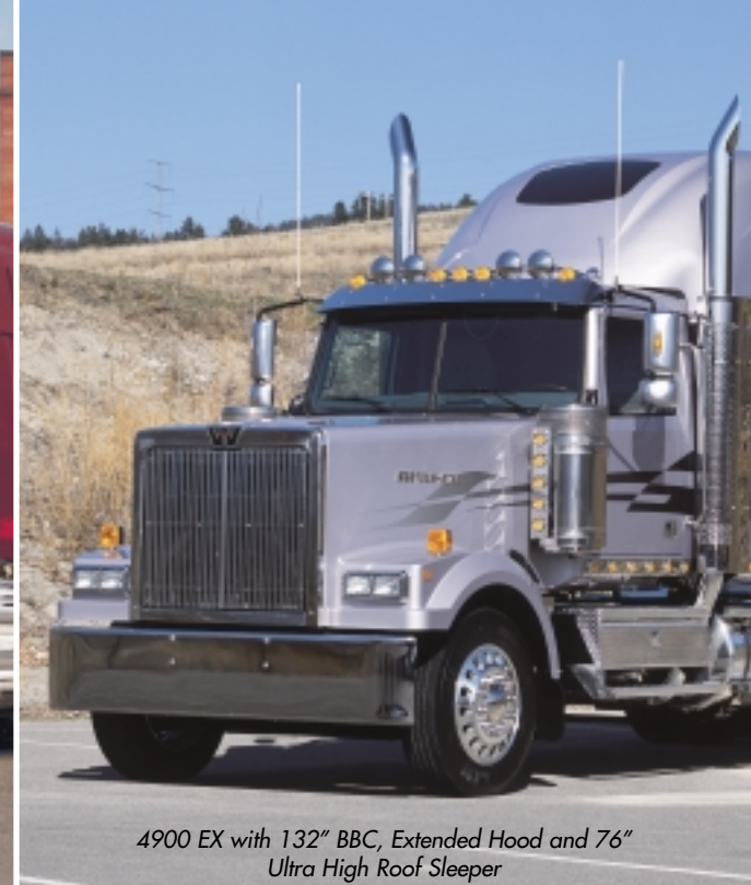
4900 EX with 132" BBC, Extended Hood and 76" Ultra High Roof Sleeper