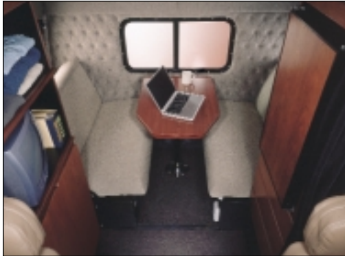
Stratosphere with Phoenix trim, SLG cabinet finish level, Dinette Sleeper Seating Package and table, plus sliding rear glass panel.