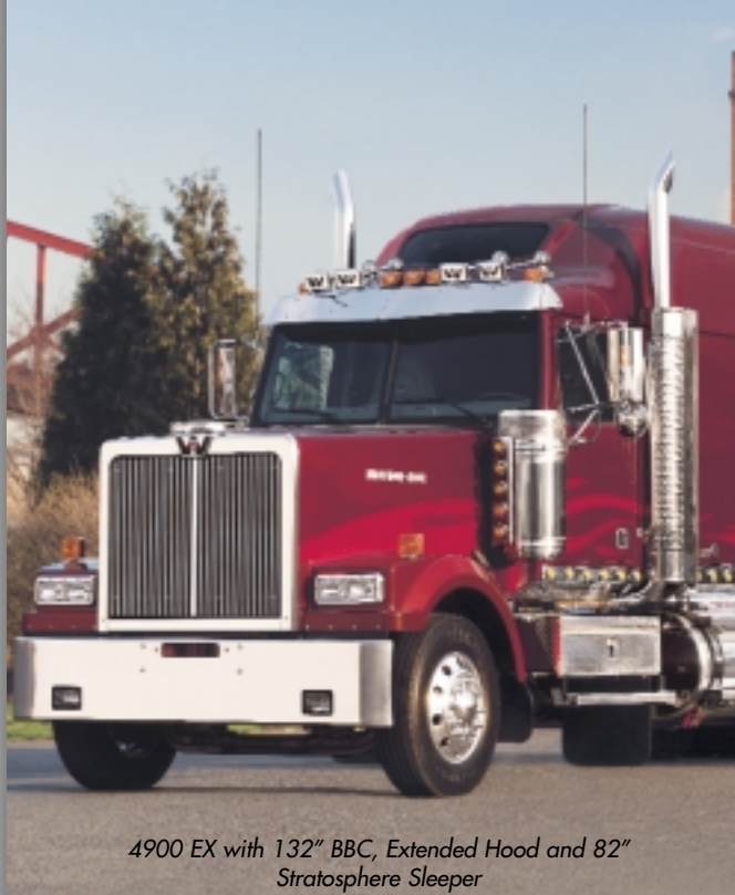
4900 EX with 132" BBC, Extended Hood and 82" Stratosphere Sleeper

Call 1-800-645-9139 for the Western Star Dealer nearest you.